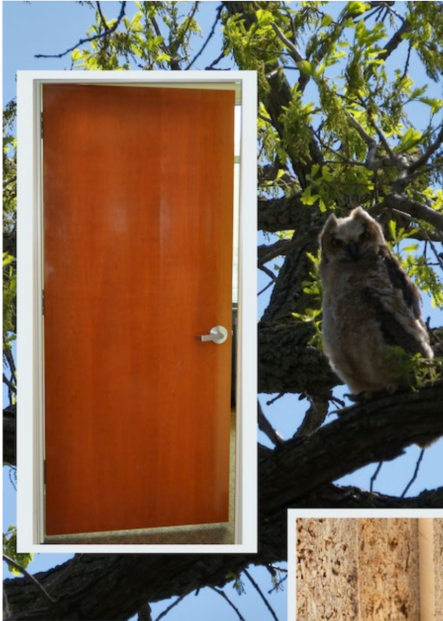
Shown above: Oshkosh Door Company leaf with wood veneer Face. Manufactured in Oshkosh, Wisconsin.

GP Series (non fire rated through 20 minute fire rated)