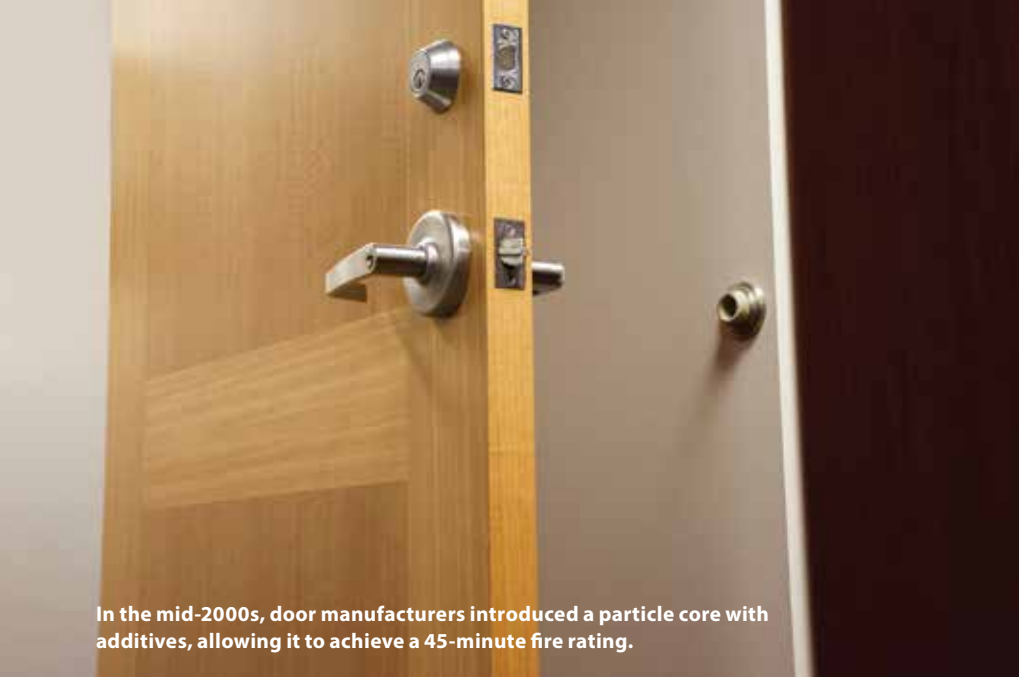
In the mid-2000s, door manufacturers introduced a particle core with additives, allowing it to achieve a 45-minute fire rating.

categories. For example, if a door passes the fire test for a period of 90 minutes, that's the best news, because it is then fire-rated for 90 minutes, as well as 60, 45 and 20 minutes.